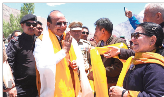
Governor on April 27, 2026, districts in the Union Territory of Ladakh. Sham district

The creation of Sham district follows the approval granted by the Lieutenant