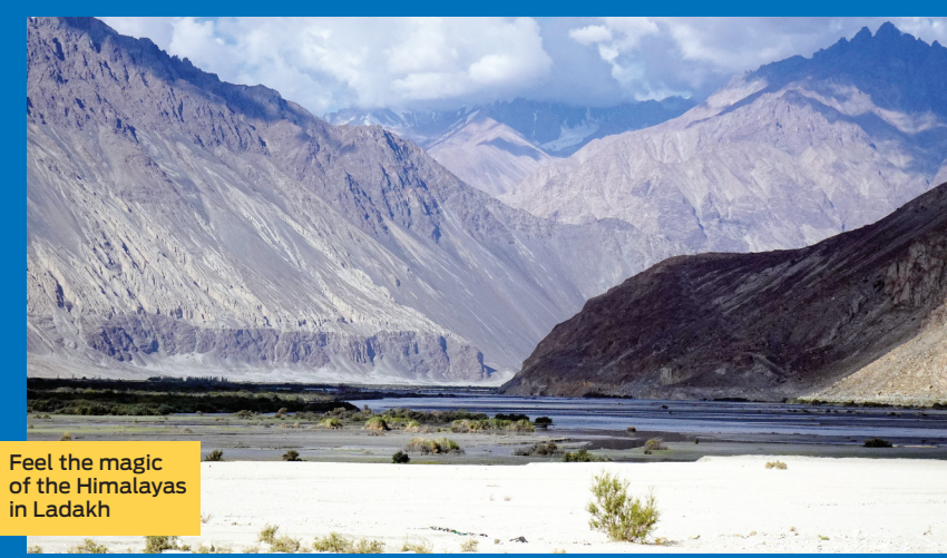
Feel the magic of the Himalayas in Ladakh