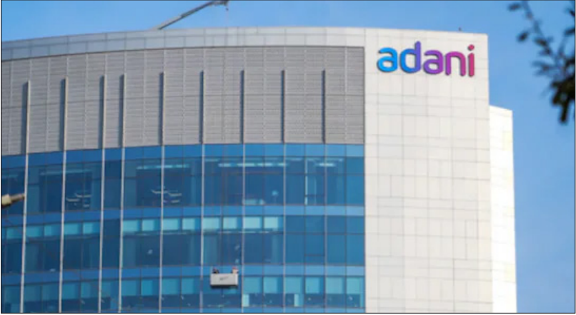
National Company Law Tribunal, Allahabad Bench. Adani Group has business operations spread across sectors like energy, resource, logistics, materials, and agro, among others. AEL is the flagship company of the Adani portfolio of companies, and AIDPL is the wholly owned subsidiary of Adani Properties Private Limited.

NEW DELHI: The Competition Commission of India (CCI) has approved the acquisition of Jaiprakash Associates Limited by Adani Group Entities. The Competition Commission of India (CCI) is a statutory body that regulates competition in the Indian economy by preventing anti-competitive practices, promoting healthy competition, and safeguarding consumer interests. In the official order, CCI stated, “The Proposed Combination relates to the acquisition of up to 100% shareholding of Jaiprakash Associates Limited (JAL) by Adani Enterprises Limited (AEL) and Adani Infrastructure and Developers Private Limited (AIDPL) or any other entity forming part of Adani Group.” The order also noted that JAL is currently undergoing a corporate insolvency resolution process under the Insolvency and Bankruptcy Code, 2016, pursuant to the directions of the