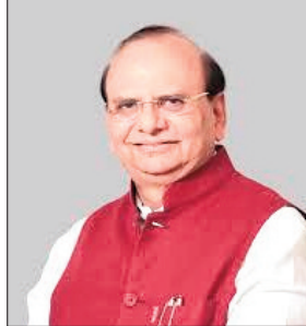
Lieutenant Governor Vinai Kumar Saxena.

LG attributes sustained tourism growth to targeted tourism reforms and infrastructure growth