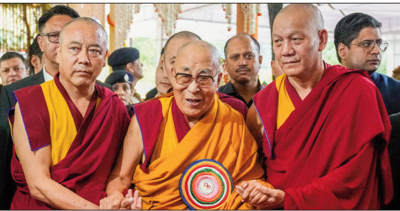
rights of the Tibetan people since the region came under Chinese occupation in the 1960s. Prime Minister Narendra Modi, who is ►P11

DHARAMSHALA: Thousands gathered in the main courtyard of Tsuglagkhang, the Dalai Lama temple, Sunday to celebrate the 90th birthday of the 14th Dalai Lama, while greetings poured from across the world for the Tibetan spiritual leader. Political leaders from India and abroad also shared the stage with the Dalai Lama, throwing their support behind the Buddhist leader, who has been living in exile in India and has been fighting for the rights of the Tibetan people since the region came under Chinese occupation in the 1960s. Prime Minister Narendra Modi, who is ►P11