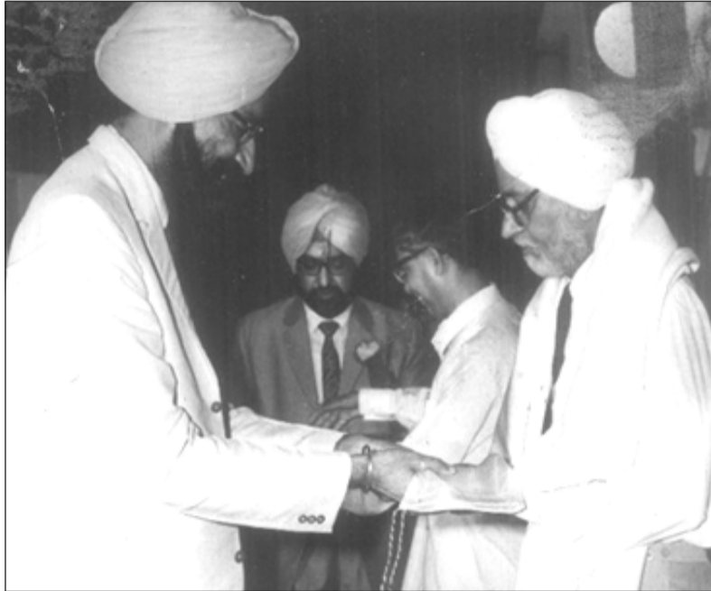
Being honoured by Bhasha Vibhag, Patiala