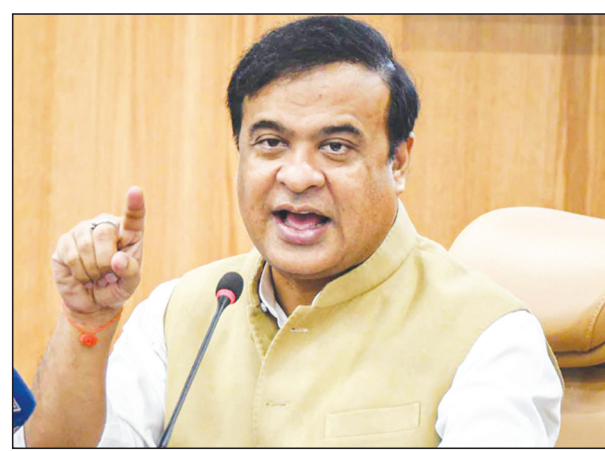
People's Front bagged 10 constituencies each. Sarma was projected as the chief ministerial candidate of the ruling alliance before the polls. "I will meet the governor and hand over my resignation after the results are submitted to him. It will pave the way for the formation of a new government," he said. Sarma further said that meeting of the newly elected BJP MLAs will be convened as per instructions of J P Nadda and Nayab

GUWAHAATI: Assam Chief Minister Himanta Biswa Sarma is likely to meet the governor on Wednesday and submit his resignation, paving the way for the formation of a new government, an official source said. Speaking to reporters here, Sarma said he will call on Governor Lakshman Prasad Acharya once the election results are officially submitted to the latter. The official source said the state's chief electoral officer is scheduled to submit the final results to Acharya on Wednesday forenoon. The NDA swept to a third successive term in the state by securing 102 seats in the 126-member state assembly. The BJP won 82 seats, while its allies Assam Gana Parishad and Bodoland