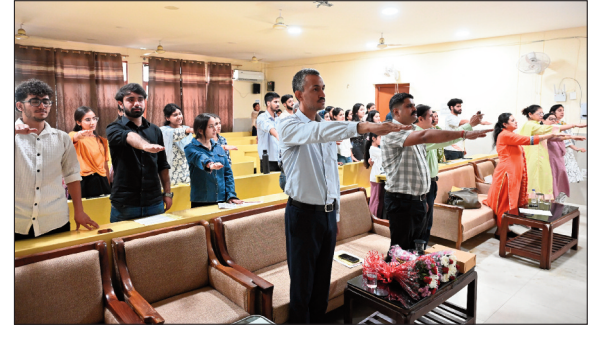
hiyaan, which is a flagship campaign to create awareness and reach youth and society for understanding the gravity of substance abuse. The youth and various stake-

JAMMU: "Healthy Youth, Prosperous Nation" Ek Sankalp - NASHA MUKT BHARAT, an awareness program, was successfully organized by Science Clubs, Ut-saah, jointly with the Department of Zoology in collaboration with, the Jammu and Kashmir Science, Technology and Innovation Council (JKSTIC), Department of Science and Technology (DST), UT of J&K on Friday at University of Jammu. Under the theme of Nasha Mukta Bharat Ab-