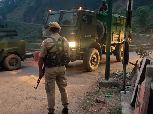
across the difficult terrain, valleys and gorges in the Dorimal-Gambhir Moghla belt of the Manjakote area, the officials said. Joint teams of police

RAJOURI: Security forces continued 'Operation Sheruwali' for the seventh consecutive day on Friday to hunt down two to three Pakistani terrorists believed to be hiding in the forests of Jammu and Kashmir's Rajouri district, while another anti-terrorist search operation was launched in neighbouring Poonch district, officials said. The forces targeted specific suspected terrorist hideouts with heavy firepower as the ultras continued shifting positions