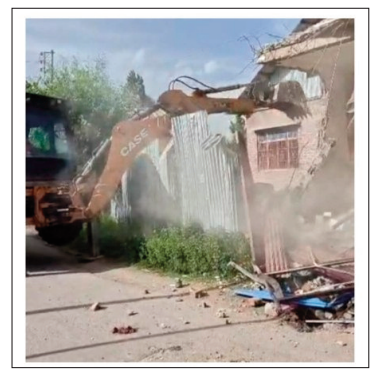
KULGAM: In continuation of the sustained campaign against drug abuse and narcotics trafficking under the Nasha Mukht Abhiyaan, Police in