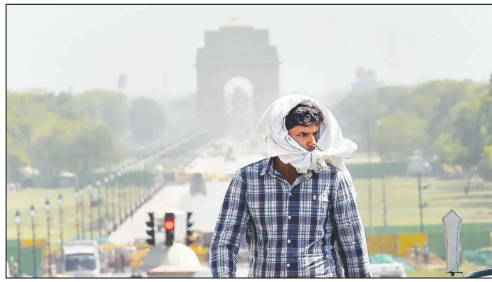
The minimum temperature hovered around 26 degrees Celsius at most stations, largely in tune with the normal for this time of the year.

Among the other stations, Ridge was the hottest at 44.6 degrees Celsius, 3.1 degrees above normal, followed by Ayanagar at 44.4 degrees Celsius, 2.3 degrees above normal, Lodhi Road at 43.8 degrees Celsius, 4.8 notches above normal, and Palam at 43.5 degrees Celsius, 2.2 degrees above normal.