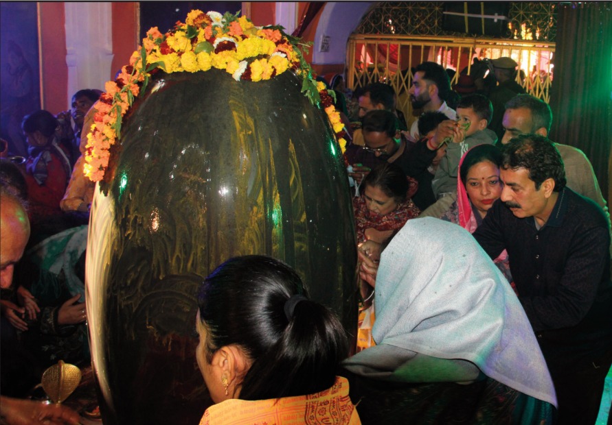
Devotees offer prayers at Shri Ranbireswar temple in Jammu on Mahashivratri